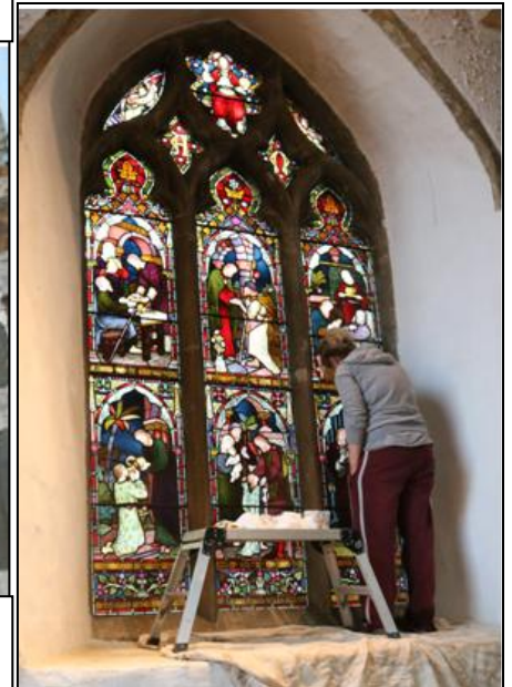
Work on a window in the Lady Chapel in the south aisle.

Work is progressing well inside the church, and the windows are already letting in so much more light than before. The colours in the stained glass windows that have been cleaned on site are becoming vivid and bright. If you are passing the church, call in to see the difference that the conservators Holywell Glass have made. We have learned that they have just been awarded a commission to undertake work on the Queen's private chapel in Windsor Castle, so we are very fortunate to have such skilled craftsmen working in the village.