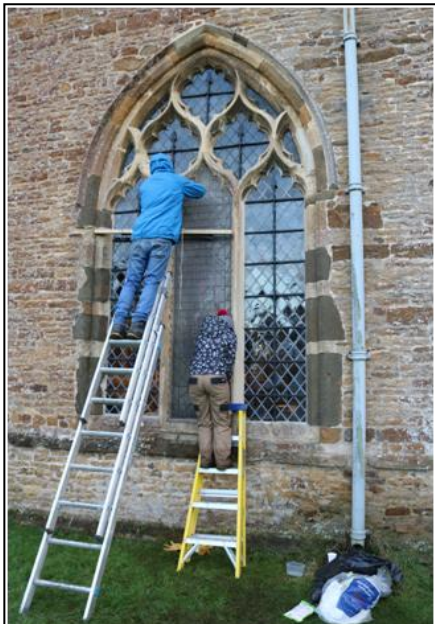
Cleaning the outside of the window dedicated to a matron of Charterhouse (north aisle)