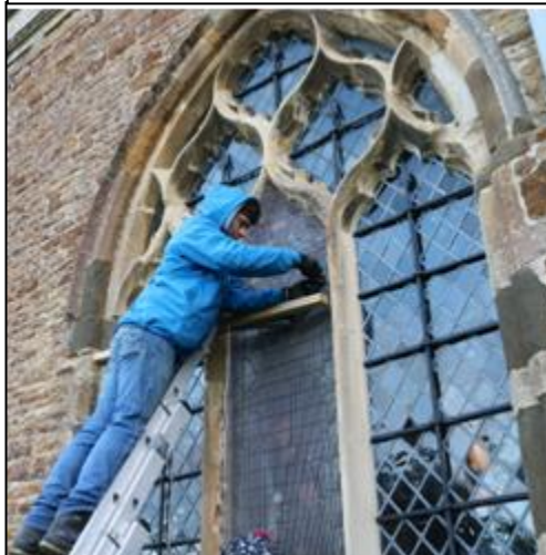
Re-attaching the metal grilles to protect the outside of the stained glass panel. The plain glass is now really clean, rather than being almost opaque.