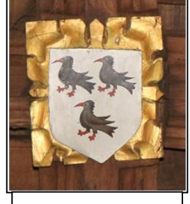
North aisle roof

1940s. His coat of arms, three Cornish choughs, were painted on one of the bosses the on the roof and the more recent frontal designed by John Childs, also includes that badge and the pallium – the Y shaped garment