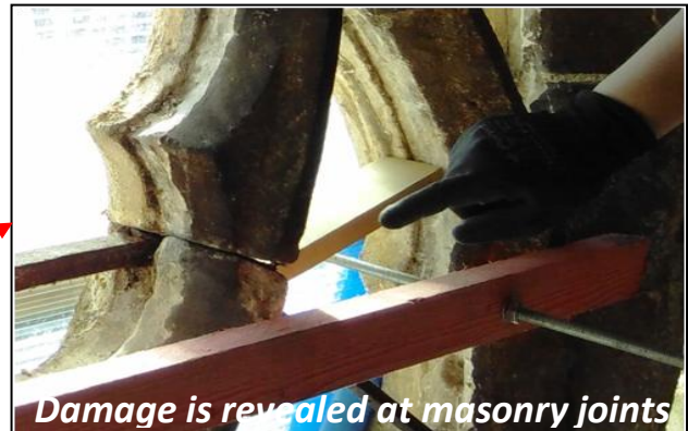
Damage is revealed at masonry joints