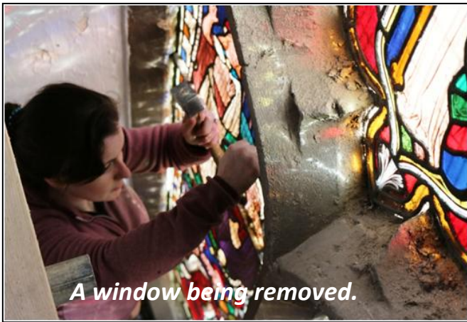
A window being removed.

Repairs and Conservation of the windows and masonry surrounds: Holywell