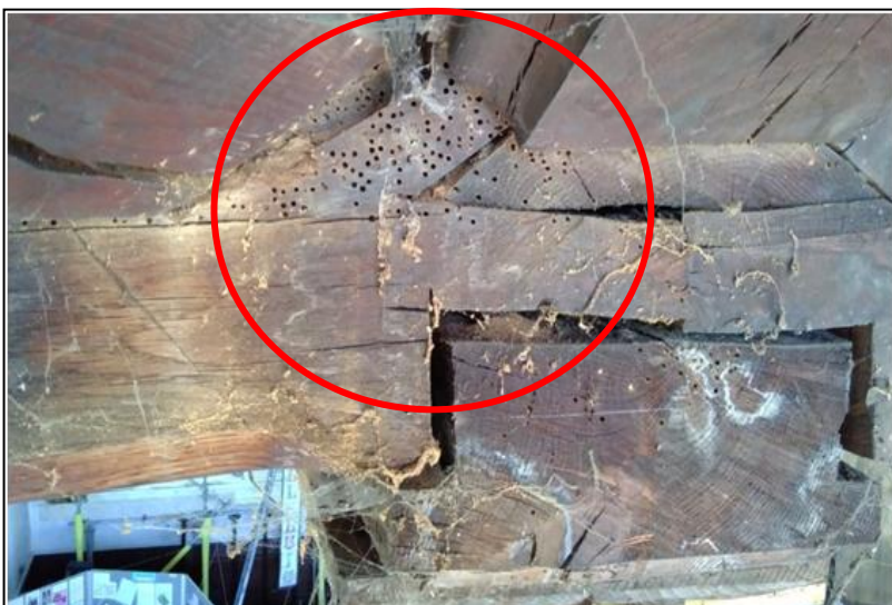
Signs of death watch beetle activity high up in the rafters