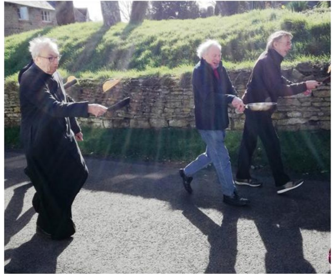
.....and they're off!