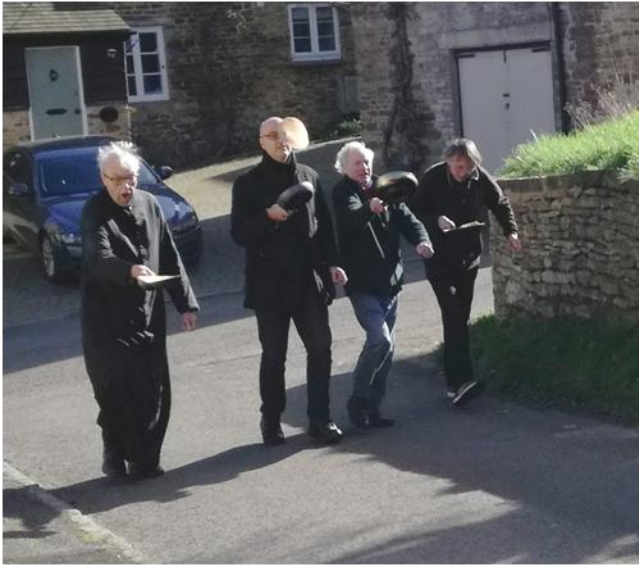
They're under starter's orders.....