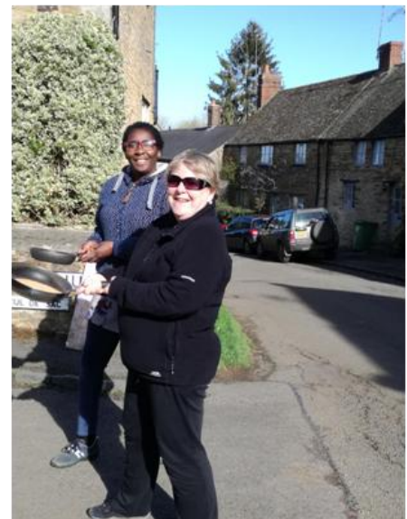
Meanwhile, taking note on the start line.....