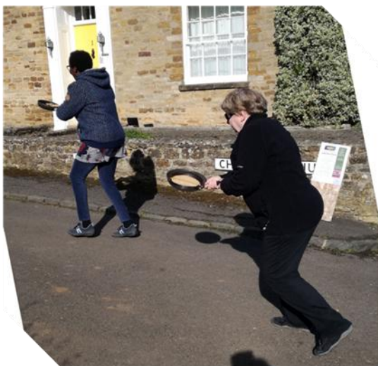
and off they go.....

....and after this, all the competitors enjoyed freshly cooked pancakes (!) for their lunch.