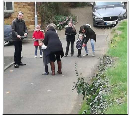
Under starter's orders.....

Shrove Tuesday 2020 – cool, and after lunch, threatening rain...which arrived in a heavy shower just as races started at 4pm! Not the best weather for the planned Pancake Races!