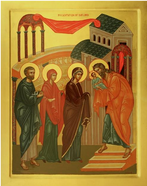
Candlemas – shown in an icon

Candlemas celebrates the 40 day old Jesus being taken to the Temple, where the old man, Simeon, calls him a “light to lighten the gentiles”. So it is a festival of light.