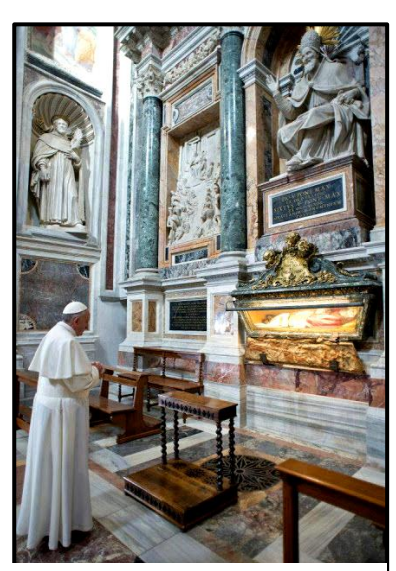
Pius V tomb

The 16th century saw a huge sea change in the nature of the papacy as it tried to deal with the reform movements of Luther, Calvin and of the Church of England. We think now of the Catholic Church's HQ as the Vatican — that small state in Rome, but five hundred years ago the popes were the sovereign of the Papal States, a swathe of central Italy and inevitably caught up in the politics of Western Europe.